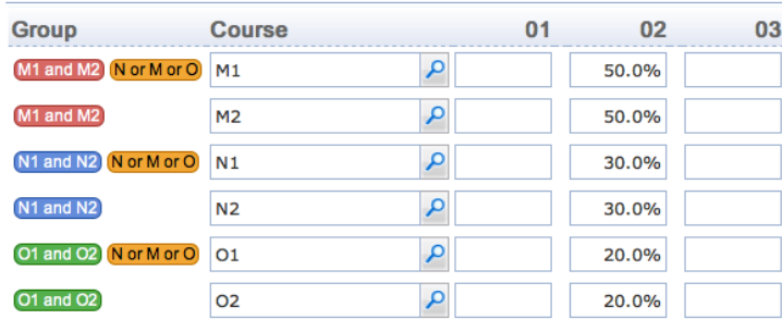
Fig. 2 Example with courses in multiple groups.

Please note that a curriculum may not contain all courses that a student in the curriculum may take during his/her study, but only courses that are offered in the term that is to be timetabled. For instance, if we are creating the Spring 2012 timetable, only courses that are offered in Spring 2012 will be present, but there will still be students associated with a curriculum that are in different years or semesters of their study. Also, if there has been a curriculum change starting in Spring 2011, students in their third year will take courses from the old curriculum whereas students in their first and the second years will need to follow the new curriculum.